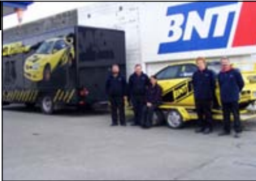
Timaru BNT Branch