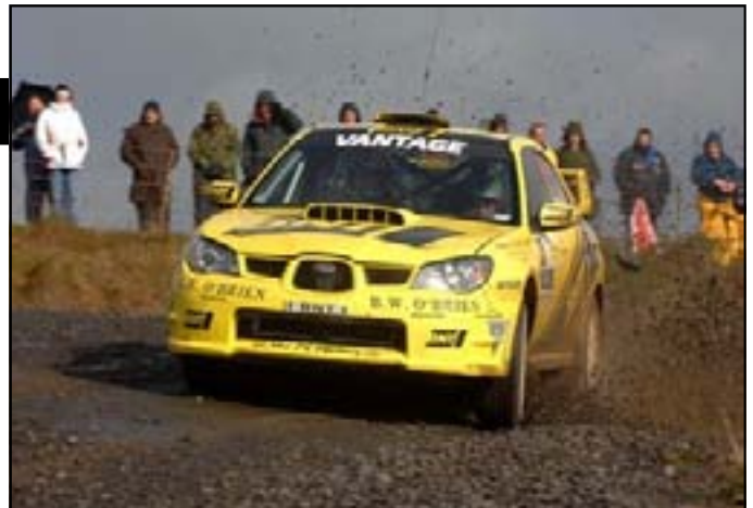
Otago rally

Stage 9 was held just up the road from Ramrock and so had similar characteristics, however there were no more dramas with rocks through here... it was a short stage and we won it by 1.1secs. We then headed back to service, where the boys were busy rubbing their hands together and waiting for the challenge that this service brought in order to have us running in top form again.